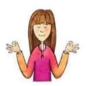
Take a break when you need one