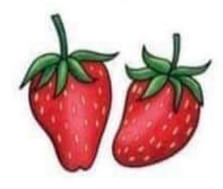
Bring healthy snacks and meals