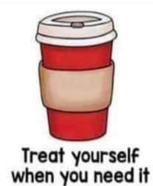
Remember to start fresh every day